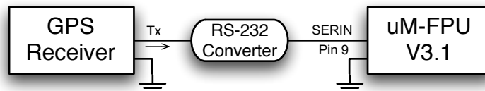
Figure 2: Connecting a GPS to the uM-FPU V3.1 chip.

Note: If the GPS serial output uses RS-232 signals, a converter will be required to convert the signal to the logic levels used by the uM-FPU V3.1 chip (e.g. MAX232 or equivalent).